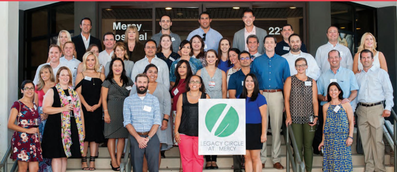
Some of the 2017 Legacy Circle members

Mercy Hospital was established with a philanthropic act more than 107 years ago. Today, that legacy of giving continues with the Legacy Circle at Mercy, a group comprised of a new generation of philanthropists.