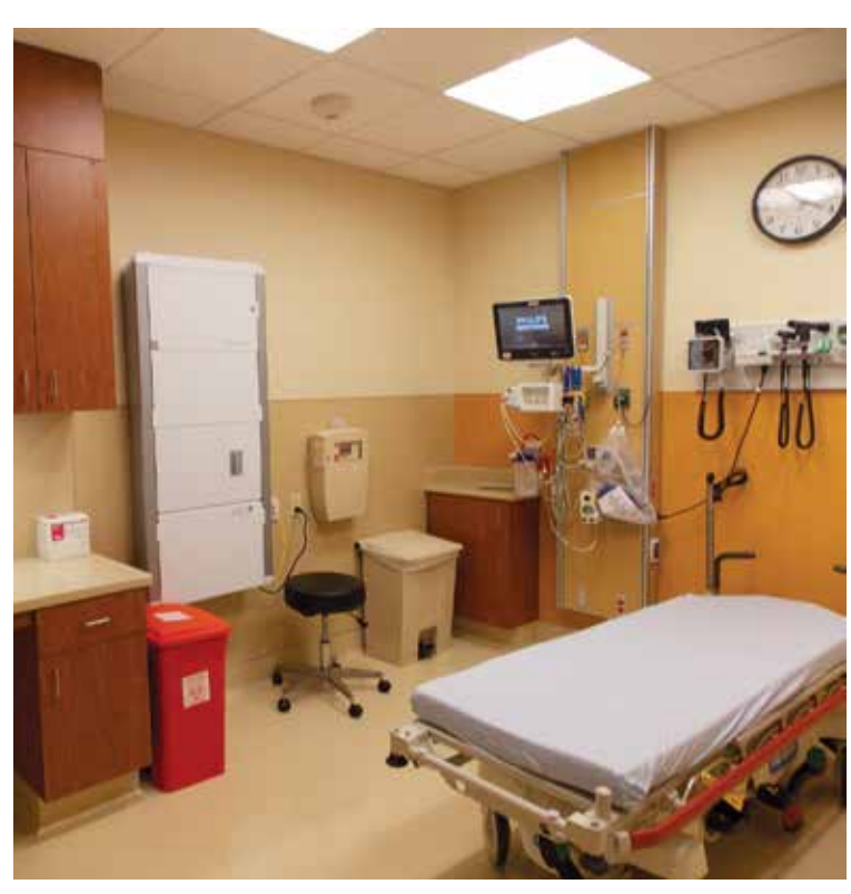
One of the new Emergency rooms at Mercy Hospital Southwest