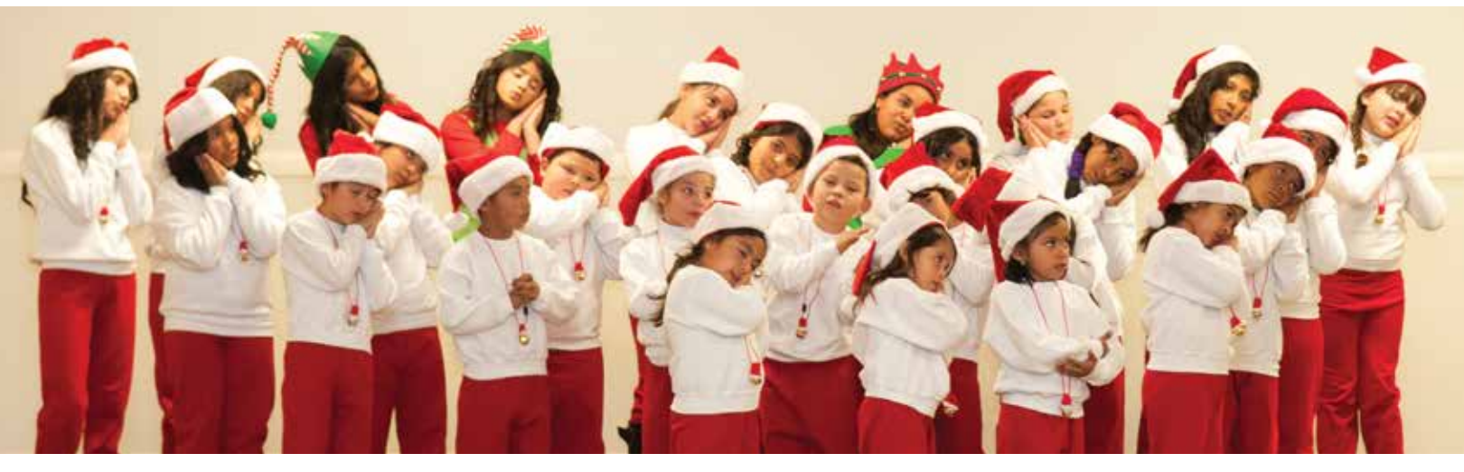
The Dignity Health Learning Center Homework Club sang carols for the Legacy Circle members at the last dinner of the Charter year.

Non-Profit Organization US POSTAGE PAID Bakersfield, CA Permit No. 294