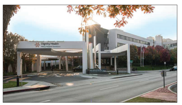
Mercy Hospital Downtown

Please contact us if you are interested in a noobligation consultation on planned giving, including options that can provide you with lifetime income and tax savings.