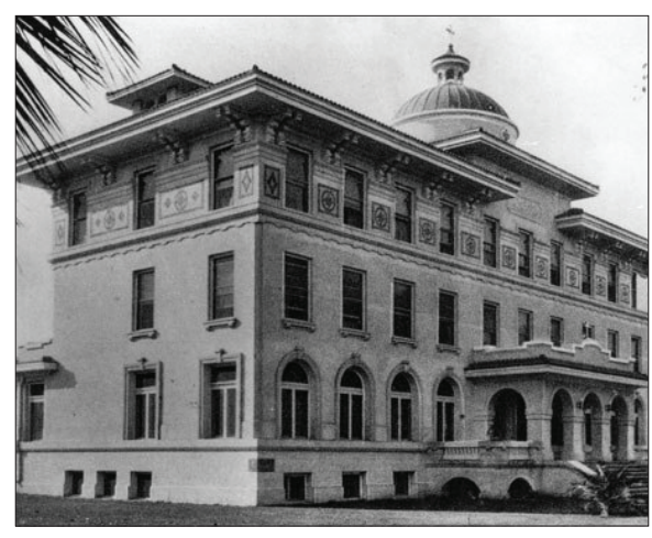
Mercy Hospital circa 1913

Your invitation to help care for our future, just like Adelaide.